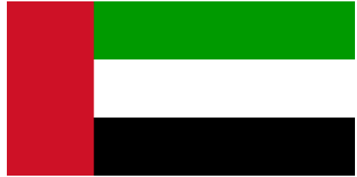
United Arab Emirates